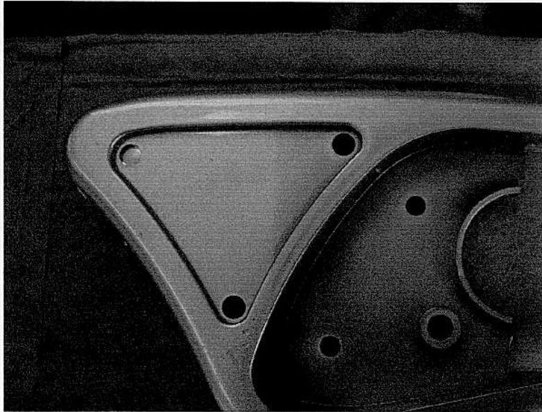
Figure 2 view of change experienced after 400 hr exposure